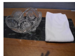
Washing bowl & Towel