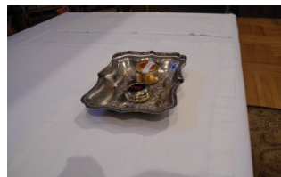
Tray with pixes