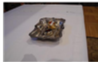
Tray with pixes