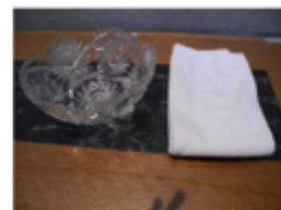
Washing bowl & Towel